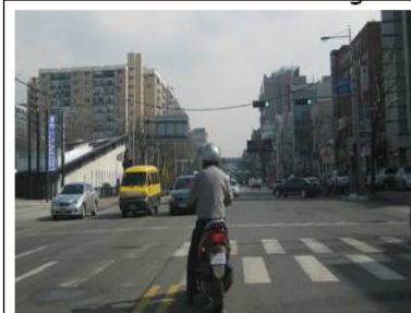
4. At the 4 th light, turn left in between Sinsa Middle School/ Hyundai High School