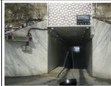
6. After 30m, the entrance is on your right