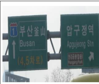
2. Cross the bridge and at the end turn right toward Apgujeong Stn