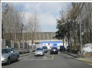
5. At the end of the road, turn left