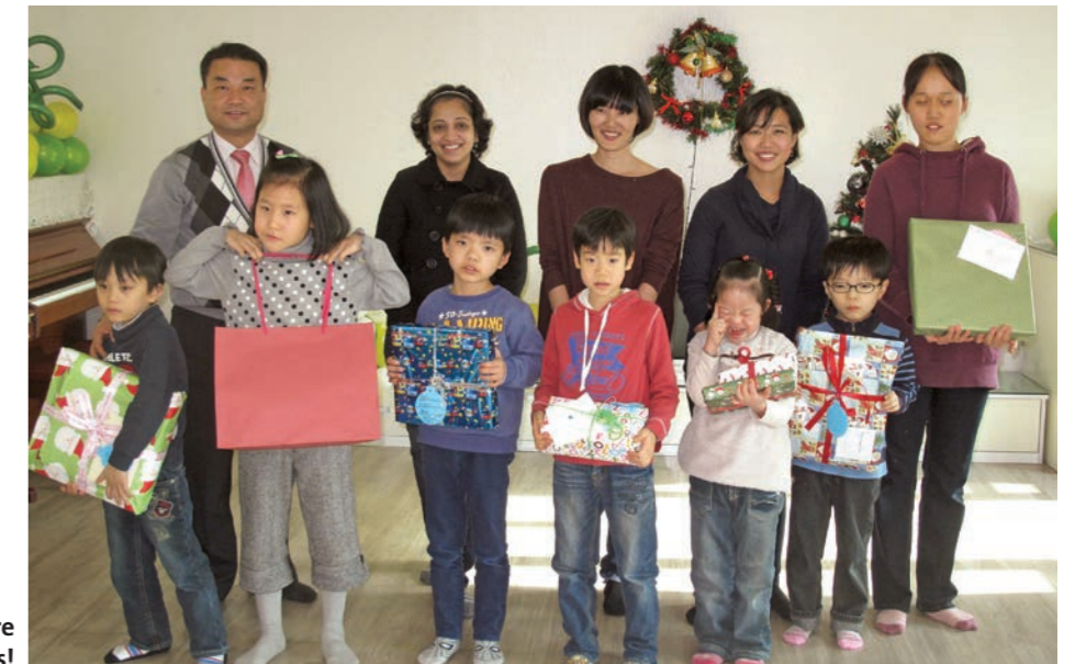
Group photo of Eastern Welfare Society children and their gifts!