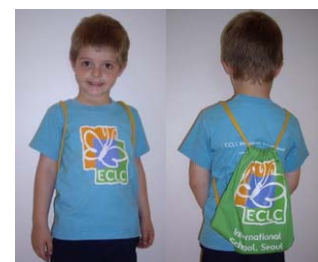
Fieldtrip T-shirt and Backpack

Additional PE Uniforms are also available.